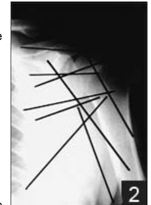
Figure 2: AP radiograph of the shoulder in the anatomic position. Black lines indicate the vector of pull of the perihumeral muscles. The lines of action of these muscles take an oblique course and generate significant cross stresses when longitudinal traction is applied.

The conical symmetry of these lines indicates that the perihumeral musculature is in the optimal position to efficiently reduce the humeral head.